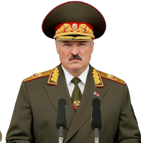
Yevgeny Prigozhin: Head of Wagner mercenary group Alexander Lukashenko president of Russia